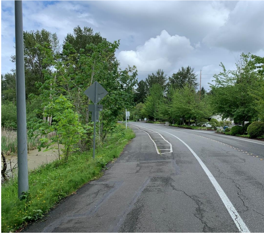
118 th AVE SE BEFORE (view looking north)