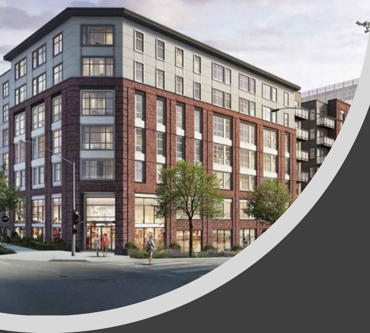
Broadstone Gateway 190 units, 38 MFTE units @ 80% AMI