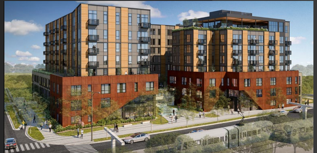
Ondina 249 units, 50 MFTE units @ 80% AMI