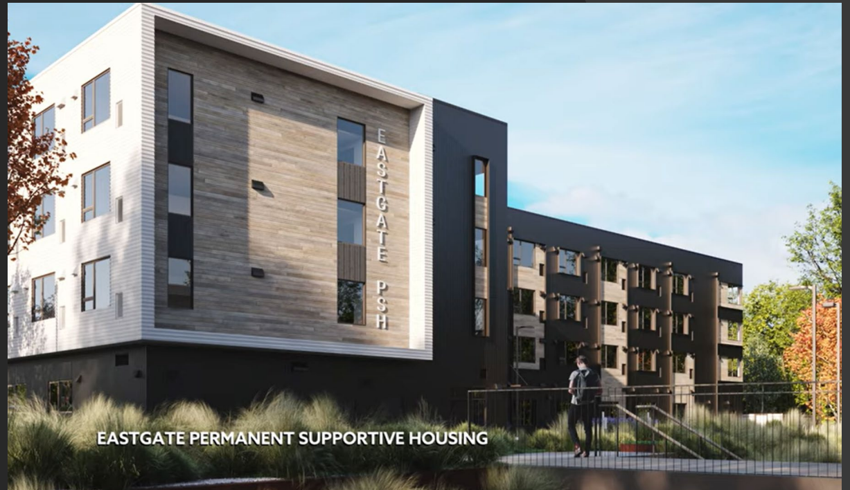
Eastgate Supportive Housing 95 units, 92 @ 30% AMI