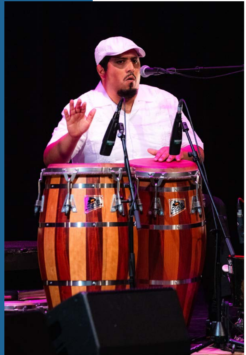
Performance at 2021 Bellwether.