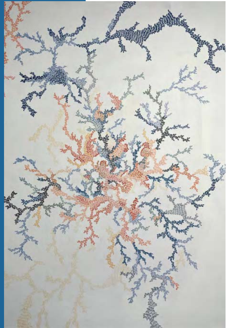
"Fire Neurons" by Xin Xin. Portable Works Collection