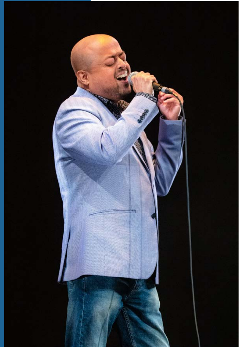
Performance at 2021 Bellwether.