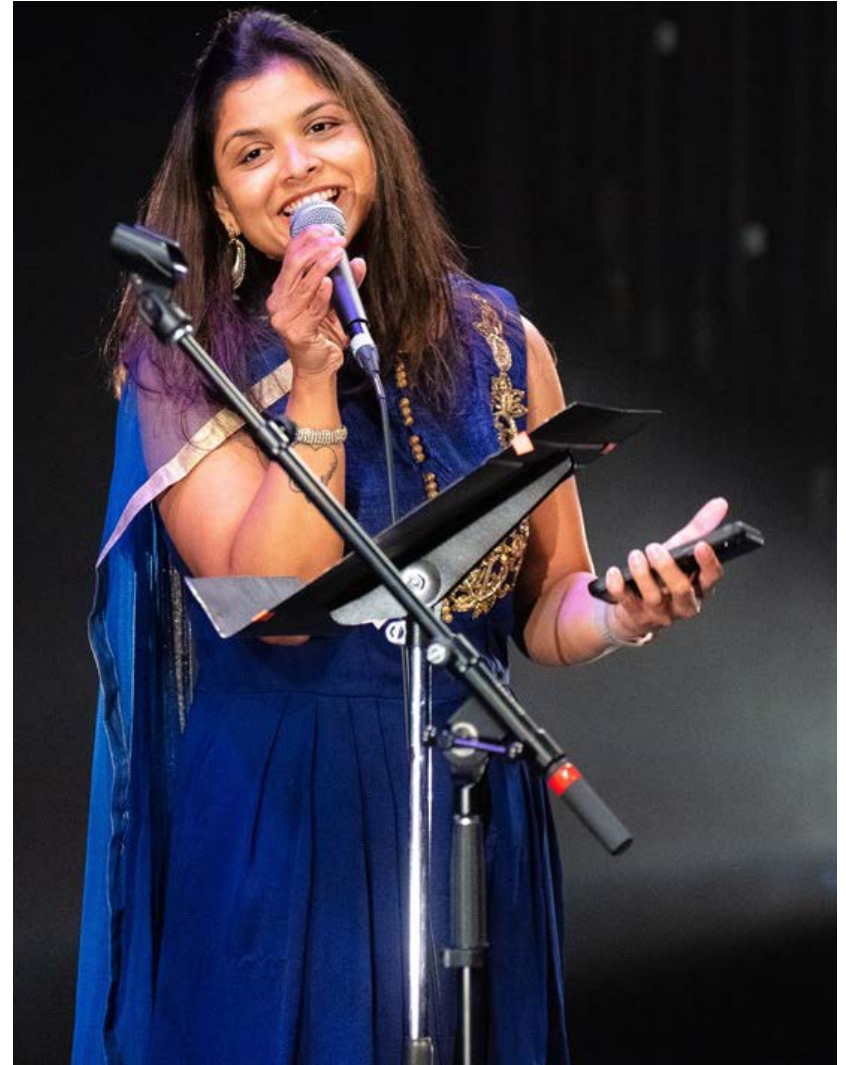
Performance at 2021 Bellwether.