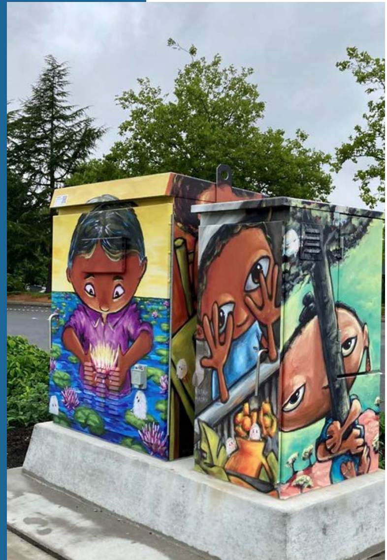
BelRed Box Wrap by Vikram Madan 2021 Box Wraps