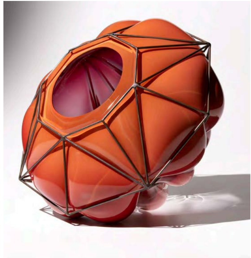
Carnelian Crystal by KT Hancock Portable Works Collection