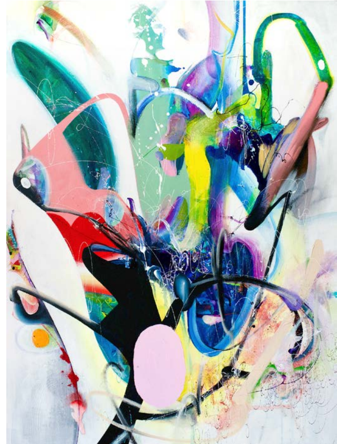
"Bunny World" by Soo Hong. Portable Works Collection.