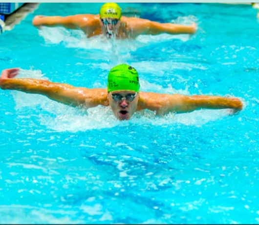
Bellevue's current aquatic center is heavily used by individuals and teams.