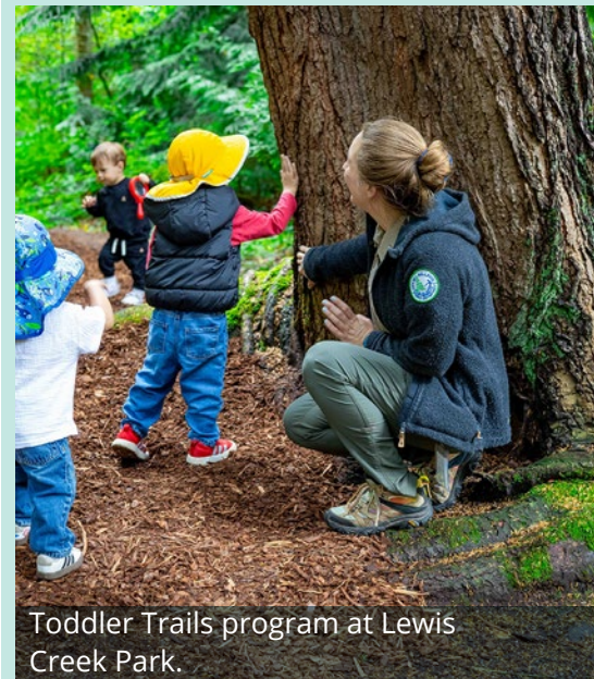
Toddler Trails program at Lewis Creek Park.