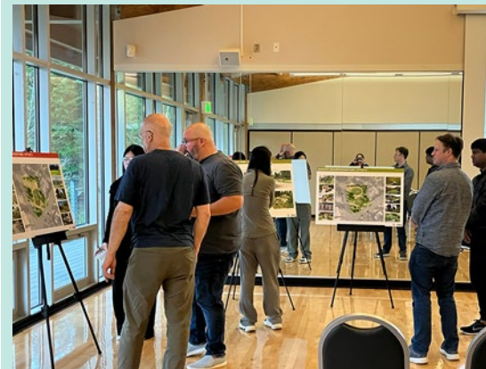
Planning for the new Eastgate Commons park site.

The master planning process for Ashwood Park began in spring 2024 and focused on updating the park’s 1990 master plan to reflect public input and significant population growth in the downtown area. In spring 2025, the City Council concurred with the design recommended by the community and the Parks & Community Services Board. The updated park design includes a large open lawn area, terraced seating, a play area, an off-leash dog area, picnic shelters, restroom, and a parking lot located off NE 12 th Street. The City Council adopted the updated plan in December 2025, and the project has entered the design and permitting phase.