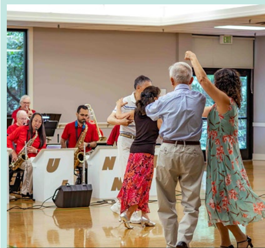
North Bellevue Community Center’s Sounds of Swing dance.

The 2022 Parks and Open Space System Plan identified significant gaps in park facilities in the Eastgate neighborhood. A design process for a new park site began in summer 2024, and the Parks & Community Services Board recommended a preferred design that was reviewed by the City Council in November 2025. The plan for this corner site features a play area for multiple ages, a flexible lawn space, a covered shelter, and picnic tables.