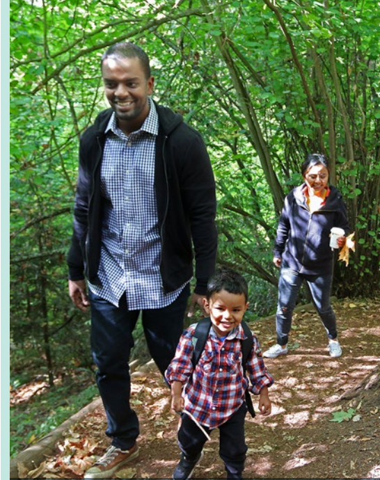
Hiking at Mercer Slough Nature Park.

The city continues to expand and enhance the trail network, connecting open spaces and providing recreational access to the many natural areas and greenways throughout Bellevue. Levy funding supported expansions in the Coal Creek trail network at the Coal Creek Ridgeline Trail, the replacement of three bridges at Lower Coal Creek (construction scheduled for winter 2025–2026), and an expansion to connect into the Forest Ridge neighborhood (currently in design and permitting).