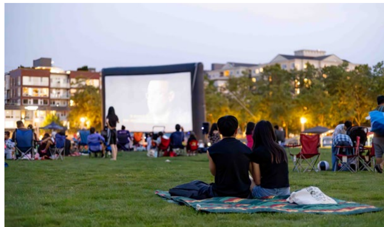
Downtown Movies in the Park.