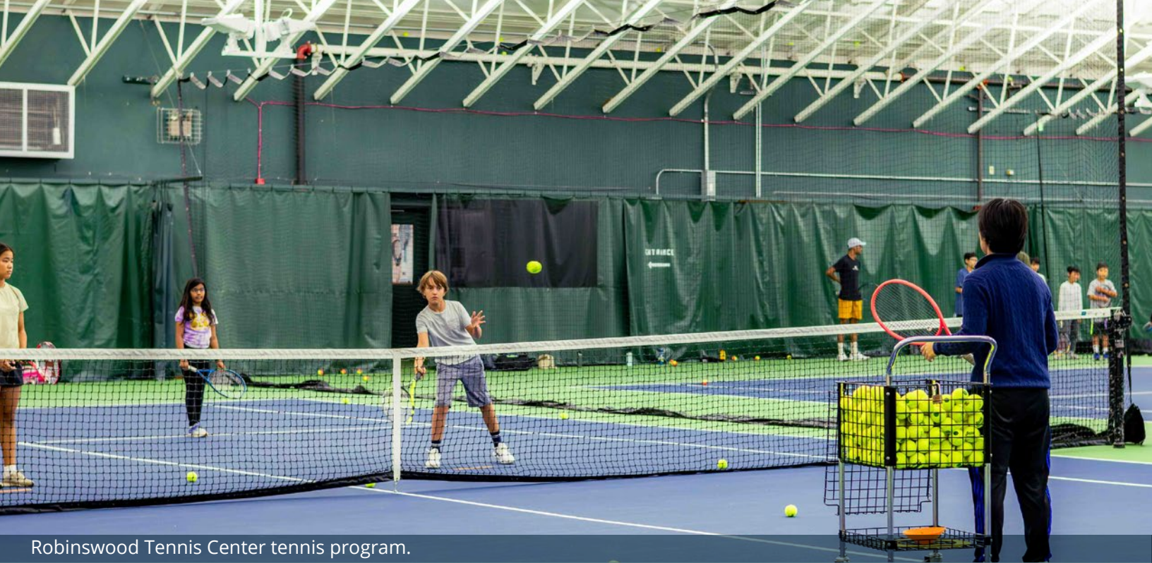
Robinswood Tennis Center tennis program.