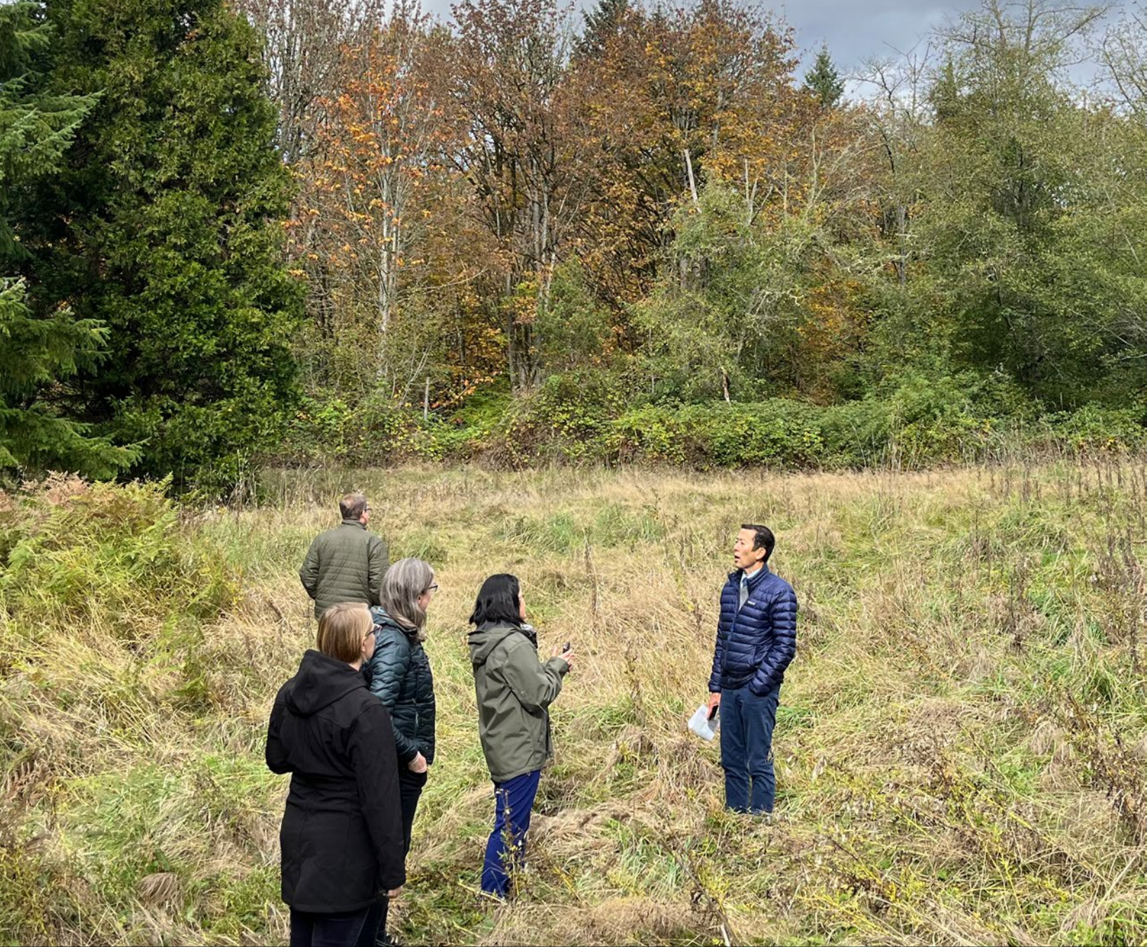
New property acquisition at Coal Creek Natural Area.