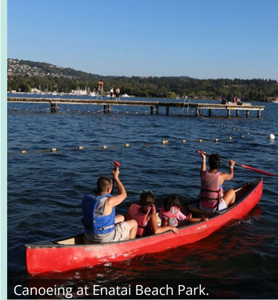
Canoeing at Enatai Beach Park.