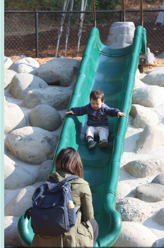
Newport Hills Woodlawn Park, funded by Bellevue’s 2008 Parks and Natural Areas Levy.

At more than 27 acres, Bellevue Airfield Park is one of the few remaining undeveloped large tracts of park land in Bellevue. In September 2024, the City Council adopted the updated Bellevue Airfield Park Master Plan, which includes a new aquatic facility, eight pickleball courts, a basketball court, a multi-use flex field, a children’s playground with multiple play zones, and a splash pad. To meet community goals for passive as well as active recreation, the plan also features accessible picnic facilities in the wooded northwest area of the site, improved trail connections, and a terraced lawn on the sloped area south of the existing stormwater ponds. The architectural and engineering designs are underway to support the first phase of construction for the park and aquatic center.