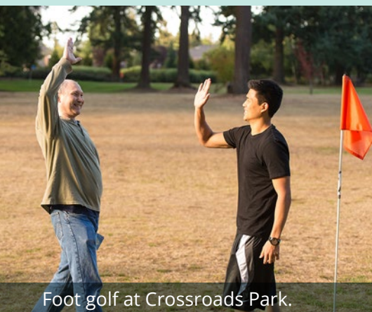
Foot golf at Crossroads Park.