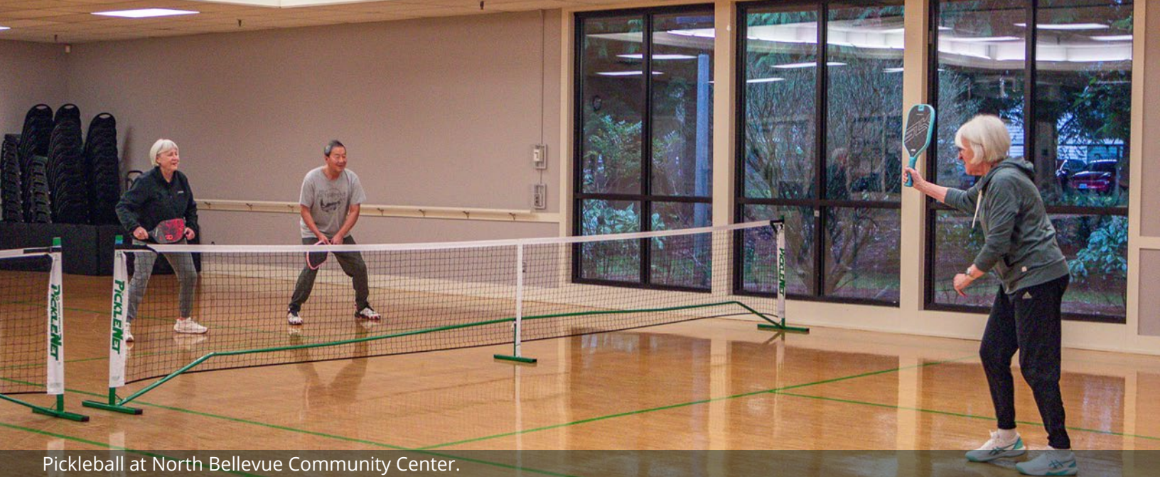
Pickleball at North Bellevue Community Center.