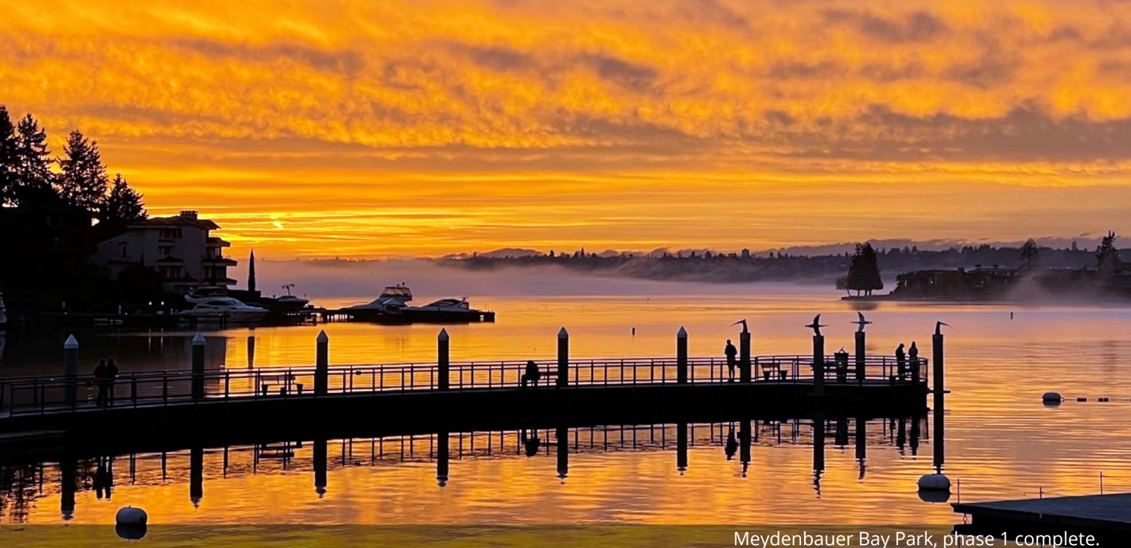
Meydenbauer Bay Park, phase 1 complete.