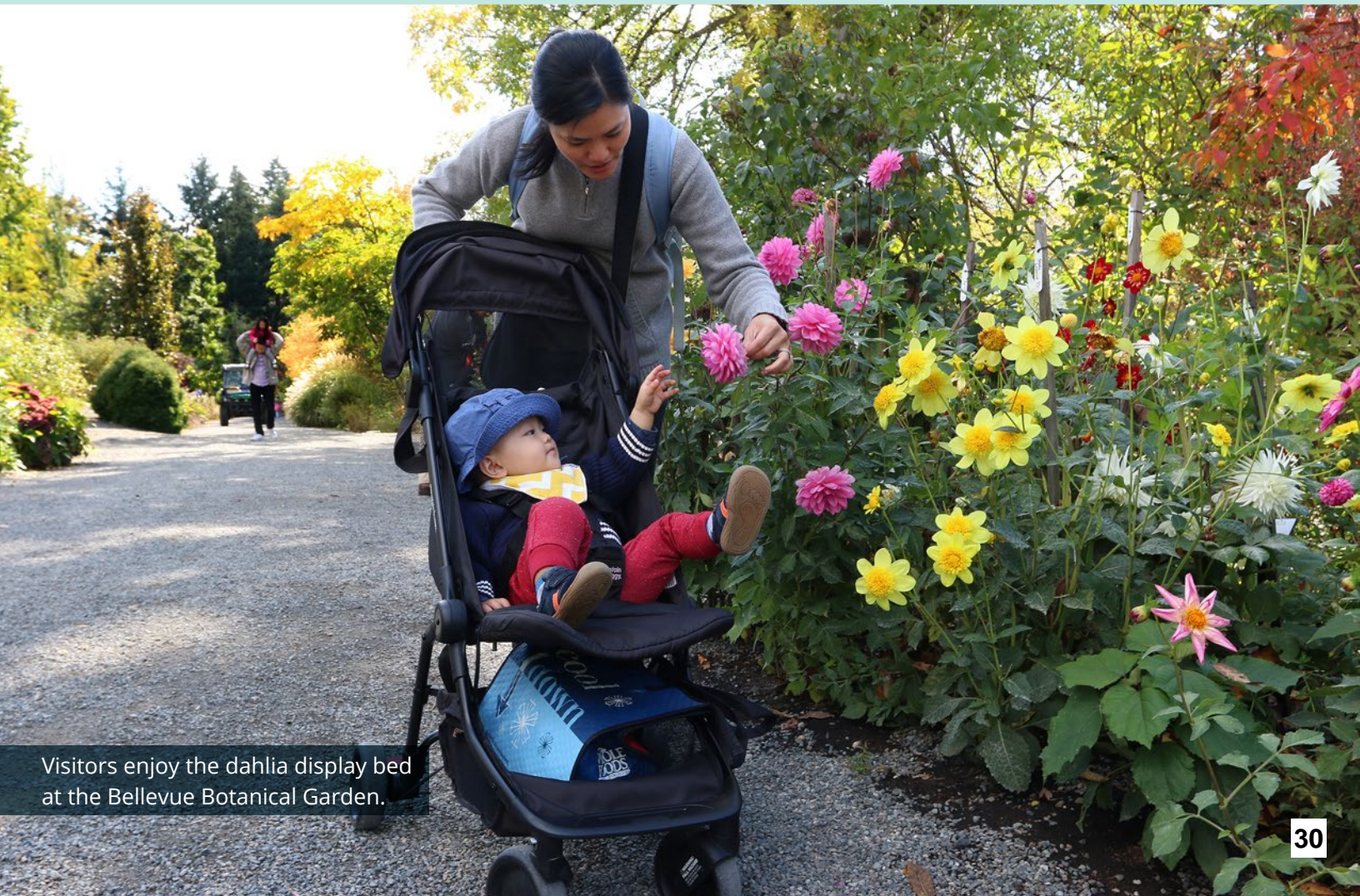
Visitors enjoy the dahlia display bed at the Bellevue Botanical Garden.