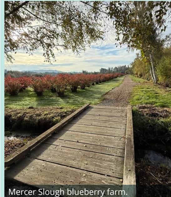
Mercer Slough blueberry farm.