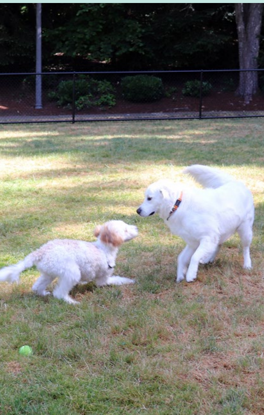
Off-leash dog area at Wildwood Park.