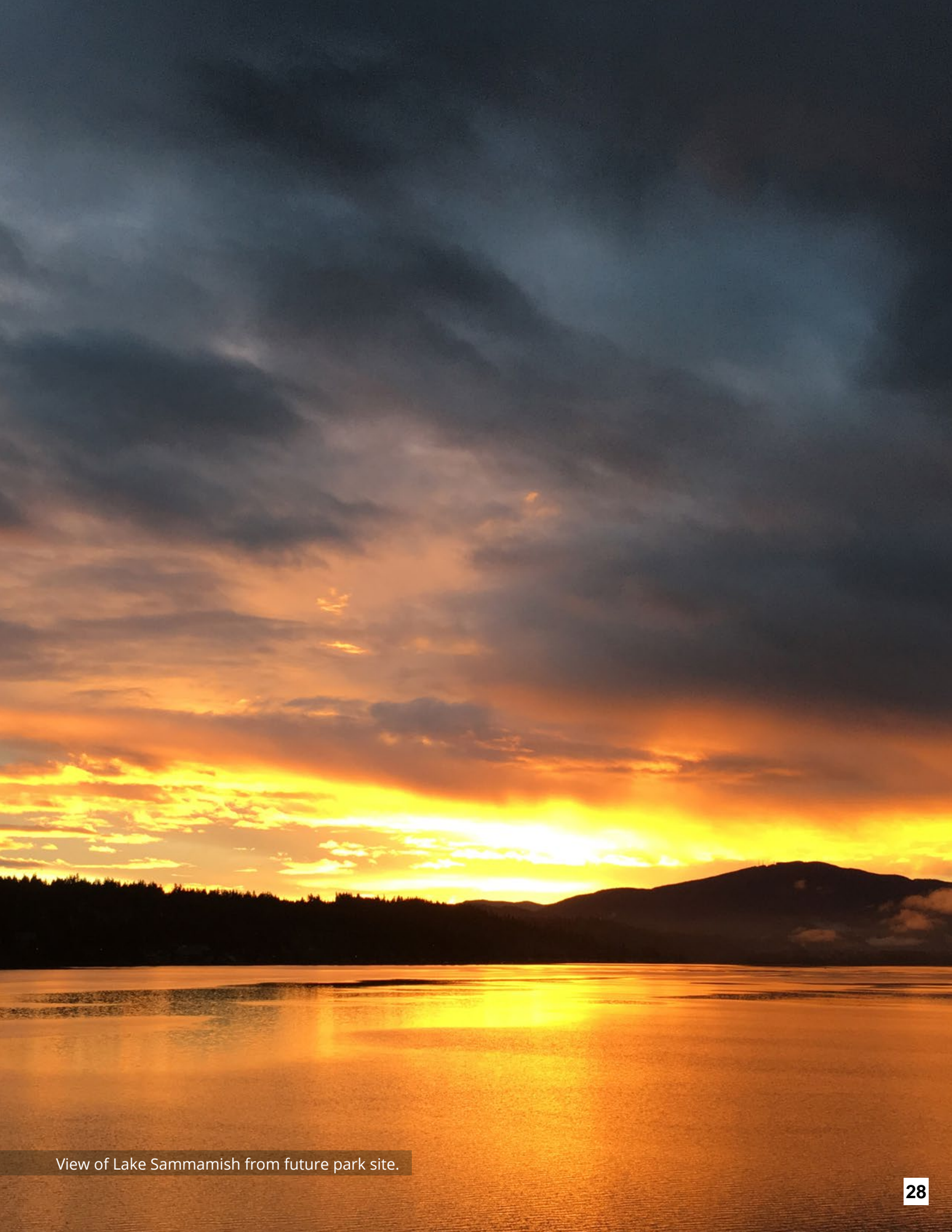
View of Lake Sammamish from future park site.