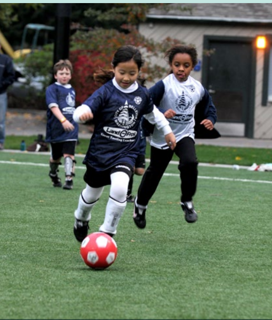
Youth soccer program.