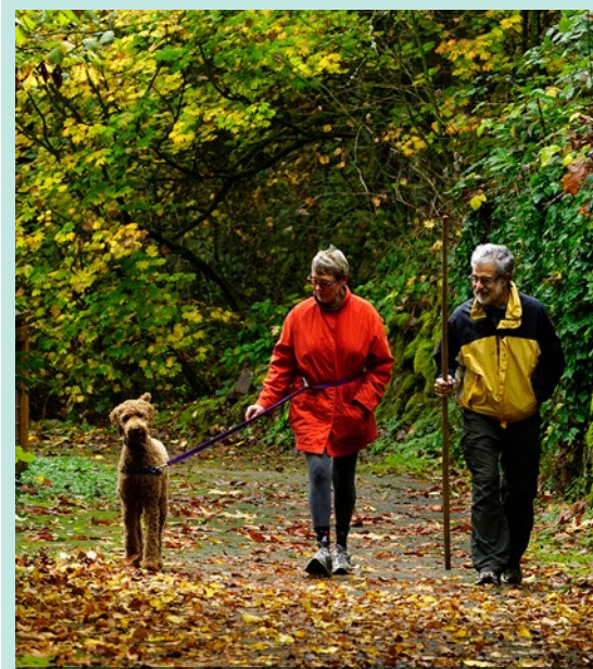
Trail at Sunrise Park.