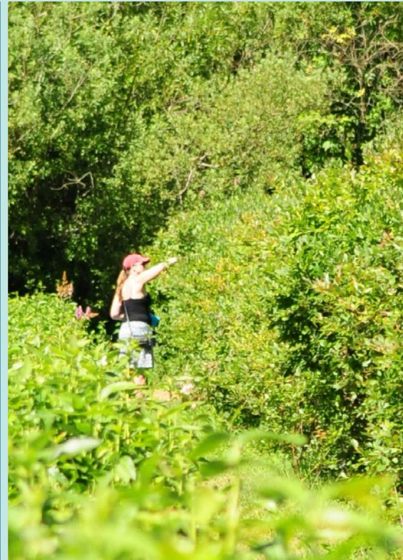
Picking blueberries at Mercer Slough.