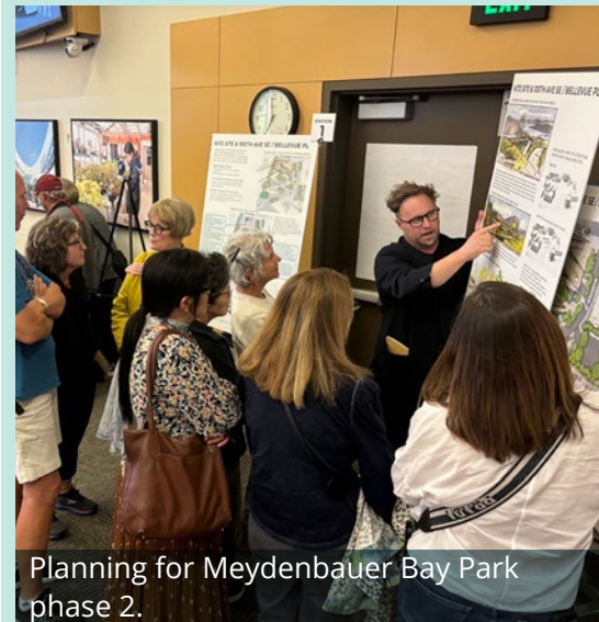
Planning for Meydenbauer Bay Park phase 2.