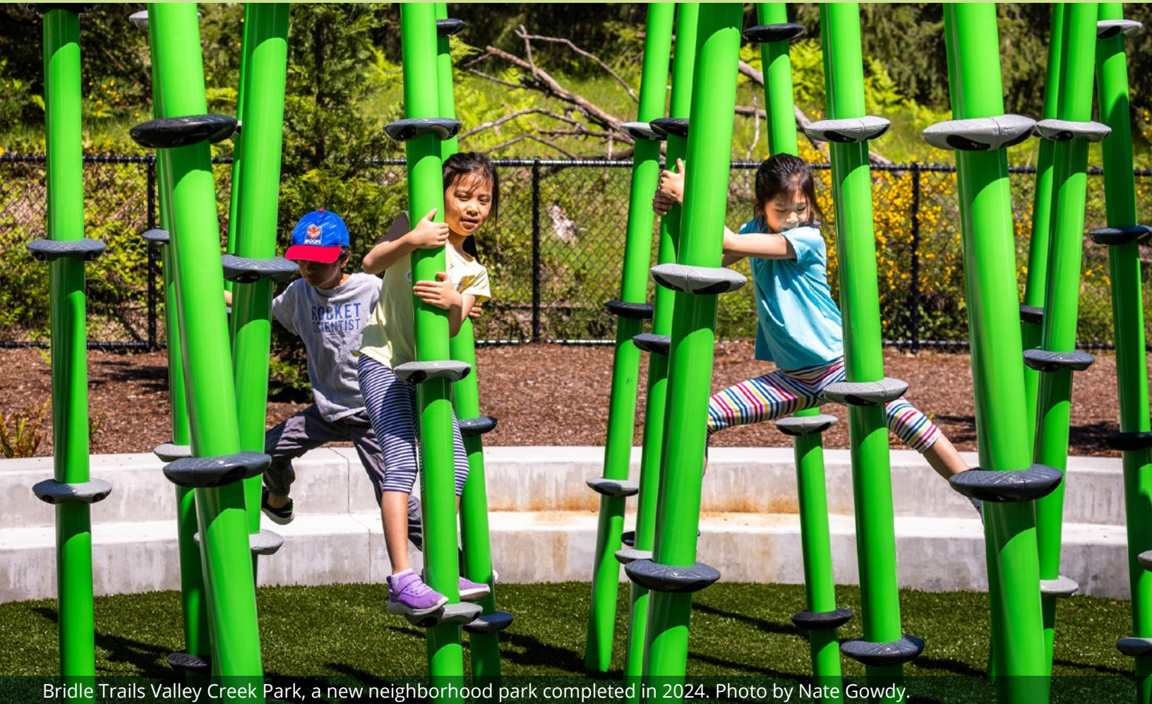
Bridle Trails Valley Creek Park, a new neighborhood park completed in 2024.