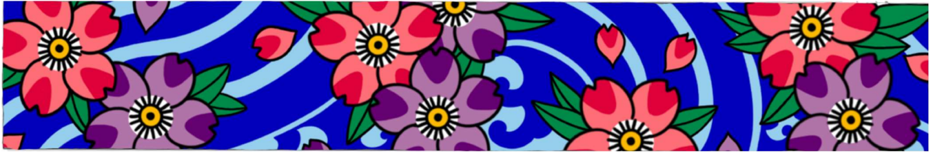
Stoll, 132nd Ave NE & Bel-Red Rd