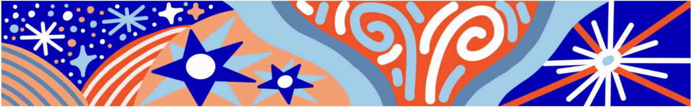
Stoll, 106th Ave NE & NE 10th St