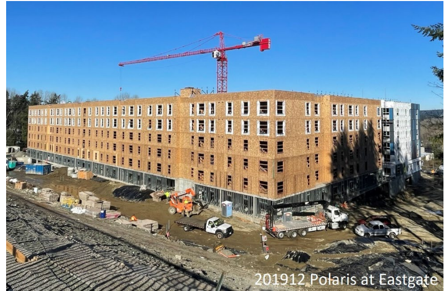
201912 Polaris at Eastgate