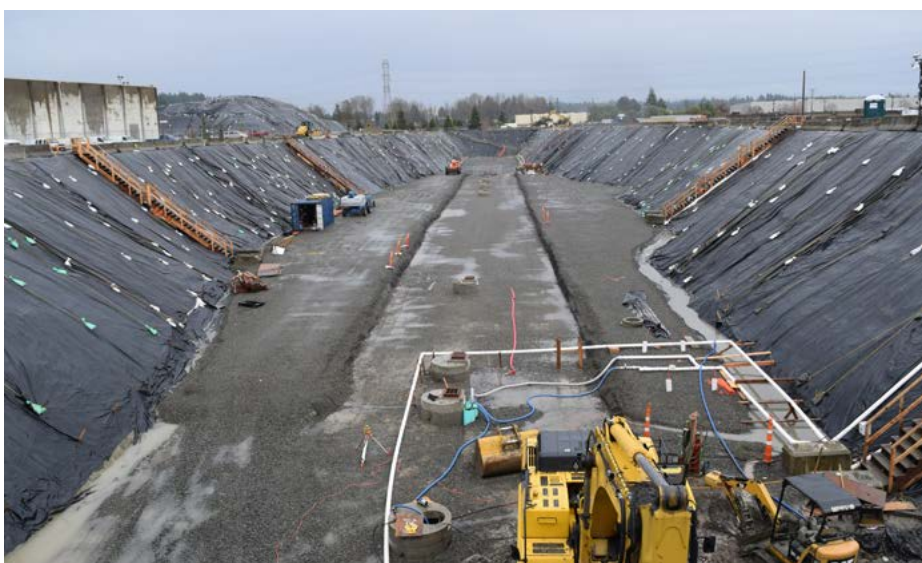
Future site of the Spring District 120th Station.