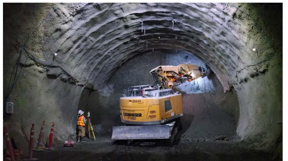
Tunnel excavation is occurring under 110th Ave. NE.

A key mitigation measure is the method in which the downtown tunnel is being built. This method is called "sequential excavation" and involves removing soil in small sections with an excavator and cutting equipment, rather than by a boring machine. Tunneling is not occurring on surface streets, less soil is being removed from the ground (and therefore less dust impacts), and there is less noise and vibration than the "cut-and-cover" method.