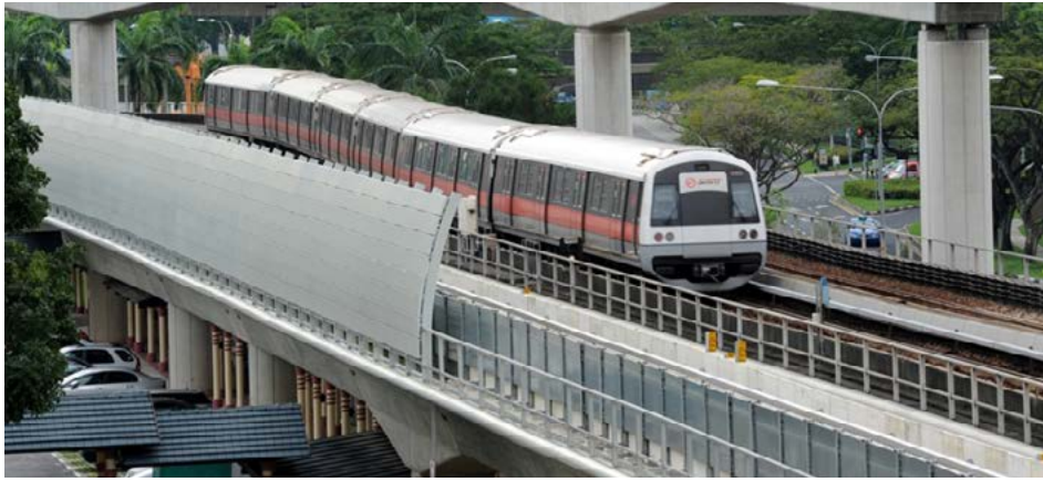
Sample acoustic panel.