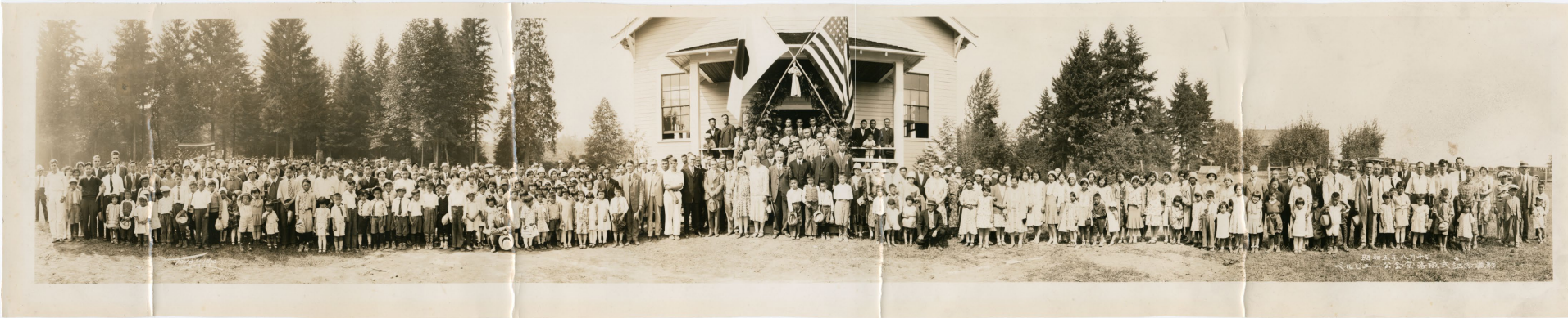
Kokaido (Japanese Community Clubhouse) in 1930, at 101 st Ave. NE and NE 11 th St.