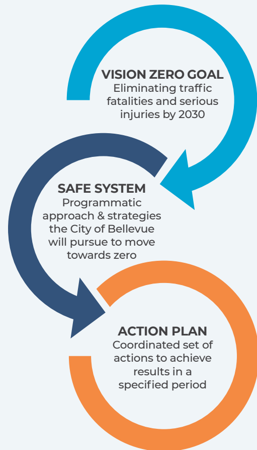
Figure 4: Annual Action Plans build on the Safe System approach and Strategic Plan—a yearly recommitment to address systemic traffic safety challenges holistically through interdepartmental “One City” collaboration.

In this context the Steering Team is working to find the best solution that delivers measurable improvement, is affordable and can be implemented in a reasonable time frame (see Figure 4). Annual Action Plans are living documents, to be continually updated as new data becomes available and as new Safe System actions prove to be successful in making Bellevue streets safer.