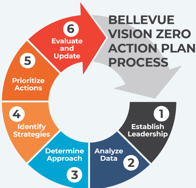
Figure 1: Process to develop Bellevue’s Vision Zero Strategic Plan and annual Action Plans.

The City of Bellevue is using a six-step process to develop, implement, monitor and refine its Vision Zero strategy (see Figure 1).