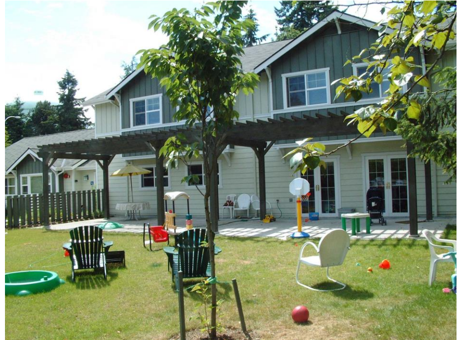
Harrington House – Family rentals – Crossroads 8 affordable units.