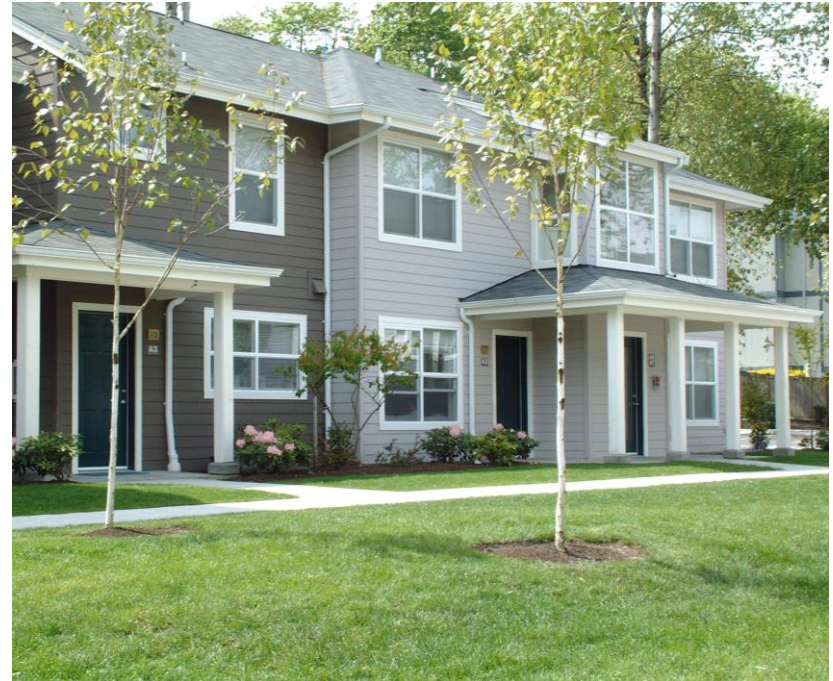
Hopelink Place – Family Housing & Daycare – West Bellevue