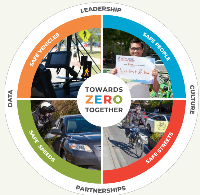
Figure 2: The Bellevue Safe System approach rests on four pillars (Safe Speeds, Safe People, Safe Vehicles and Safe Streets) paired with four supportive elements (Data, Leadership, Partnerships and Culture).

In its advisory role in the development of the city’s Strategic Plan, the Bellevue Transportation Commission examined the attributes of the Safe System approach and concurred that Safe People, Safe Streets, Safe Speeds, Safe Vehicles—as well as the supporting elements of leadership, culture, partnerships and data—all help contribute to reducing the frequency and severity of crashes (see Figure 2). This holistic approach accepts that people will make mistakes and that crashes will continue to occur, but it aims to ensure these do not result in serious injuries or fatalities.