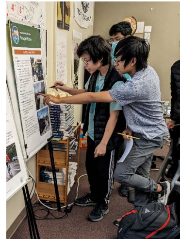
Students at Newport High School review policy moves

Youth were able to view information boards on proposed policy moves, provide feedback and ask questions. Follow up activities included a field trip to City Hall for students from Big Picture School to practice giving testimony and attendance at future Planning Commission meetings for Bellevue High School students.