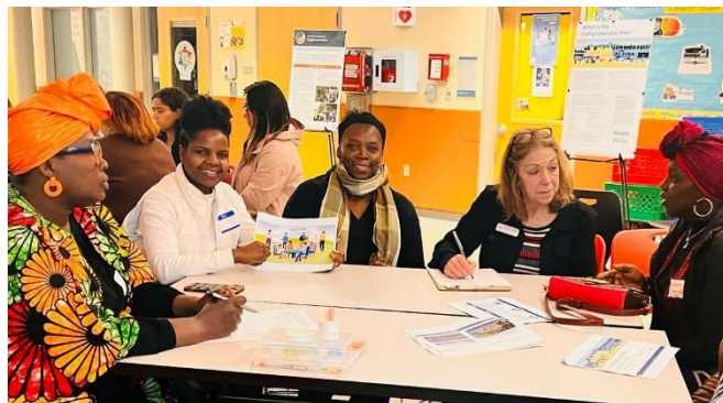
Members of Africans on the Eastside at BDAN event

The planning team collaborated with the members of the Bellevue Diversity Advantage Network (BDAN) to host an evening event targeted towards diverse communities. Members of BDAN conducted outreach to various community groups, helped design the agenda, and led parts of the program.