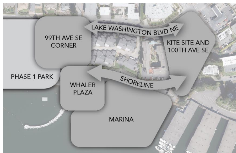
Meydenbauer Bay Park: Potential Phase 2 areas

The graphic below highlights areas of focus or potential Phase 2 design opportunities. The design team has now developed and analyzed multiple Phase 2 opportunities and strategies aligned with the adopted master plan and responsive to current community feedback.