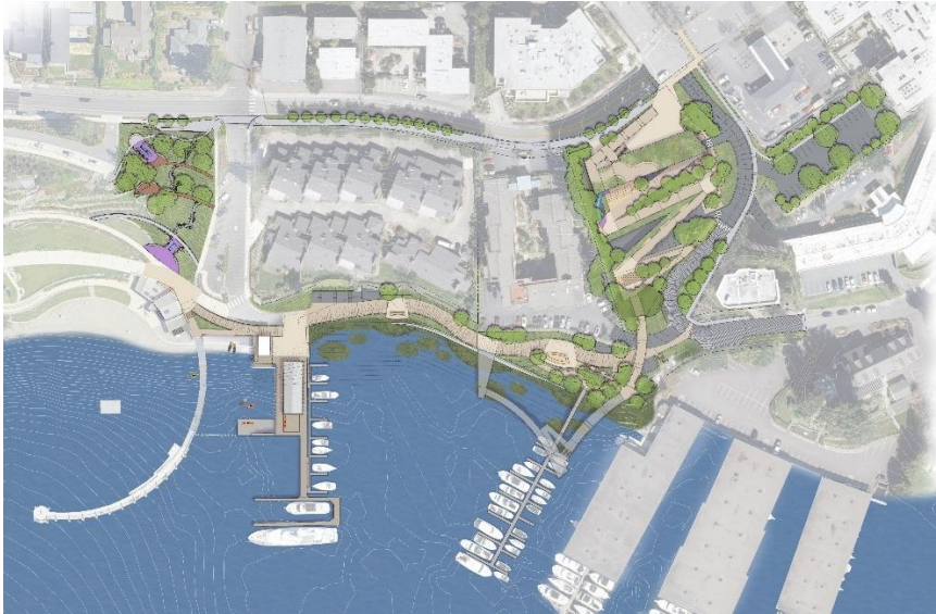
Meydenbauer Bay Park: Conceptual Design (at complete buildout)

Based on additional community feedback, the design team has developed a Phase 2 conceptual schematic design plan. The graphic below depicts the Park at complete buildout. More detail on each area and a recommended implementation plan for elements to be included in Phase 2 construction will be shared with the board during the meeting. The Kite Site/100th Street and Connection to the existing marina shoreline has been identified as the community's preferred next phase of development of the adopted master plan.