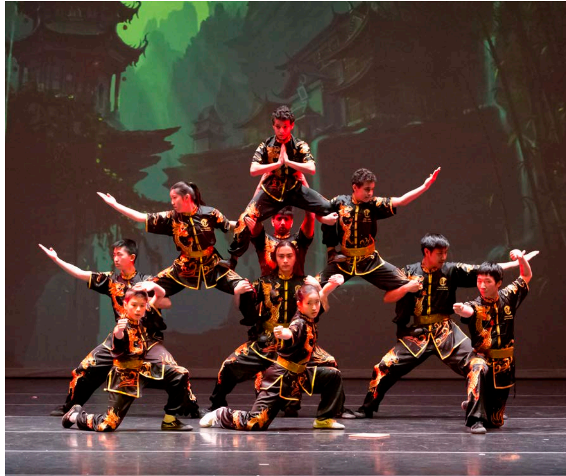
American Asian Performing Arts Theatre