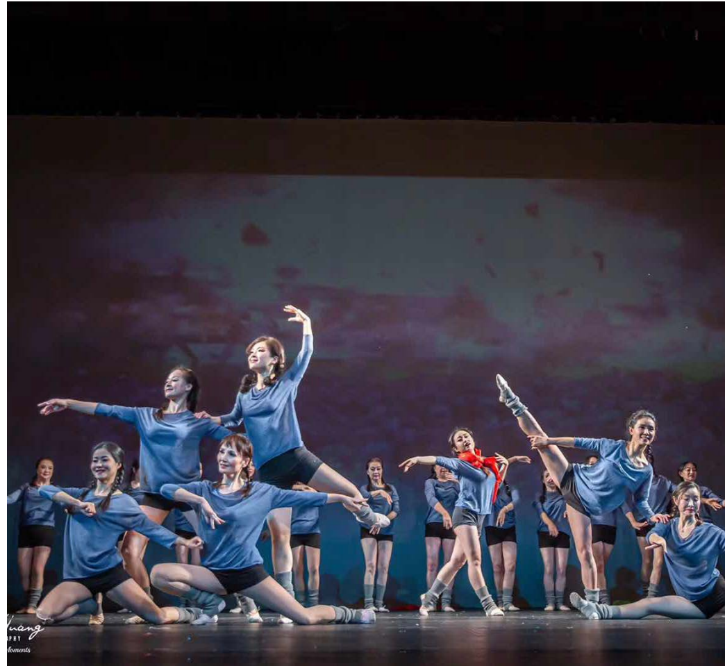
The Huayin Performing Arts Group