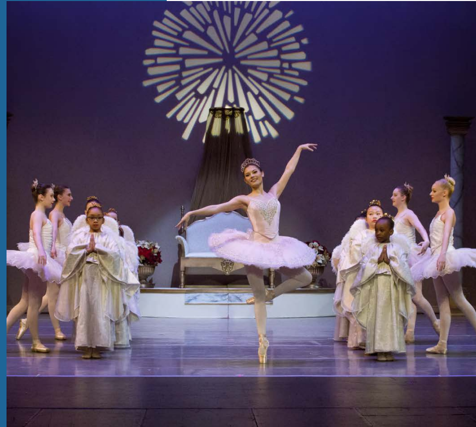
Evergreen City Ballet

Move to approve the Arts Commission recommendations for 2021 Eastside Arts Partnerships, Special Projects, and Power Up Bellevue allocations and direct staff to proceed with implementation.