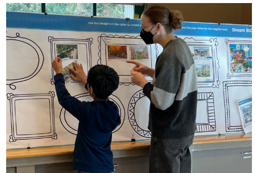
Youth sharing their neighborhood vision at a public space workshop in Crossroads