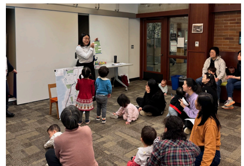
Families participating in a mapping exercise during Newport Library's Chinese story time