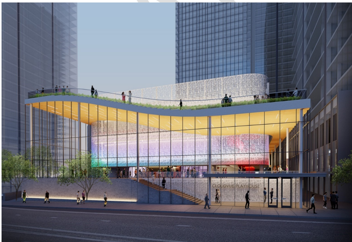
Exterior Rendering, looking west across 110 th Street, Courtesy LMN Architects, Seattle

The CLOUDVUE development is scheduled to break ground in early 2022, with Playhouse construction to commence in 2023, and a projected opening in late 2025.