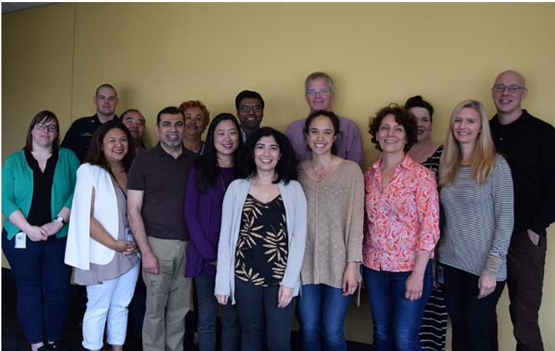
Cross-departmental Diversity Liaisons