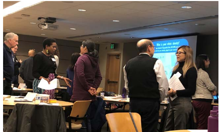
Commissioners & Board members at Cultural Competence Foundations training.