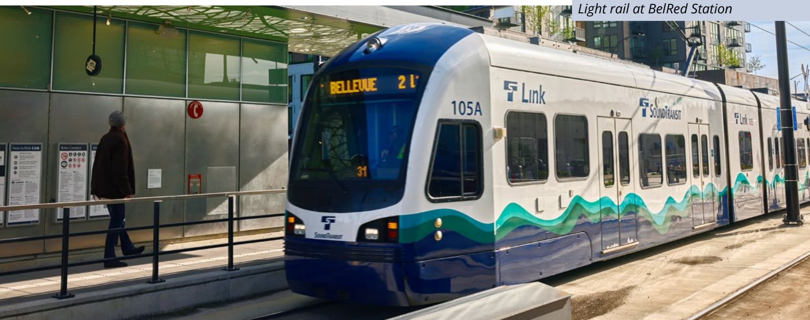
Light rail at BelRed Station