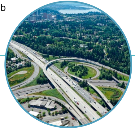
Aerial of I-405 and the SR 520 Interchange

One of the most congested and unsafe interchanges in East King County, this project will reduce congestion on both I-405 and SR 520. This project will improve safety and access to medical facilities and the Spring District – an urban neighborhood and job center connecting to light rail and regional trails. The SR 520/124th Avenue NE Interchange project is at the end of the preliminary engineering phase and is envisioned as a design-build contract.