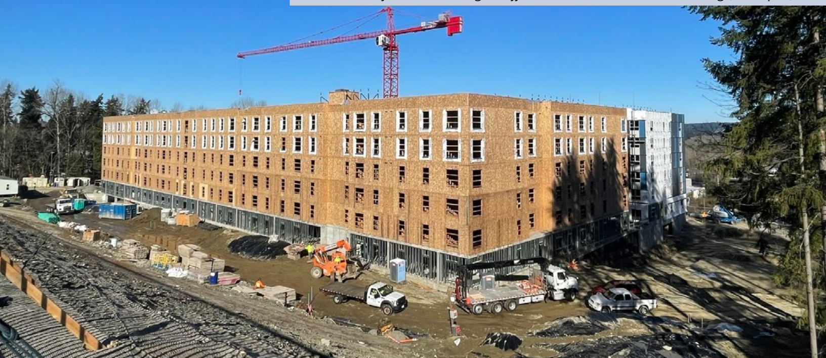
Construction of Polaris at Eastgate affordable income-restricted housing (now open)

The city supports the Association of Washington Cities' 2025 legislative agenda items that serve the best interests of Bellevue.