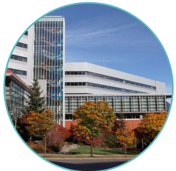
Bellevue City Hall