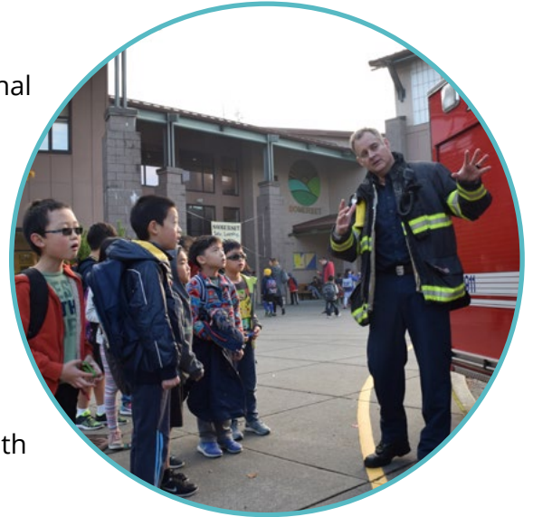
Firefighter speaking to students at Somerset Elementary School