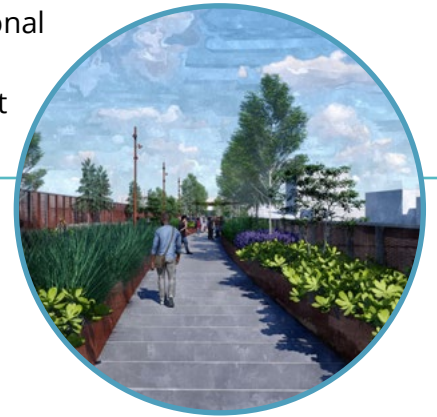
Rendering of the Bellevue Grand Connection crossing I-405

This project would improve the safety and accessibility of the public gathering space at Bellevue's City Hall Plaza for more than 40,000 people each day. When the Bellevue Grand Connection I-405 Crossing is complete, it will connect light rail to Eastrail and the bicycle and pedestrian network throughout East King County. Capitalizing on the regional investment of Sound Transit's 2 Line, this project is critical in preparing for the arrival of the Grand Connection I-405 Crossing, future bus rapid transit lines, and new public facilities near City Hall.