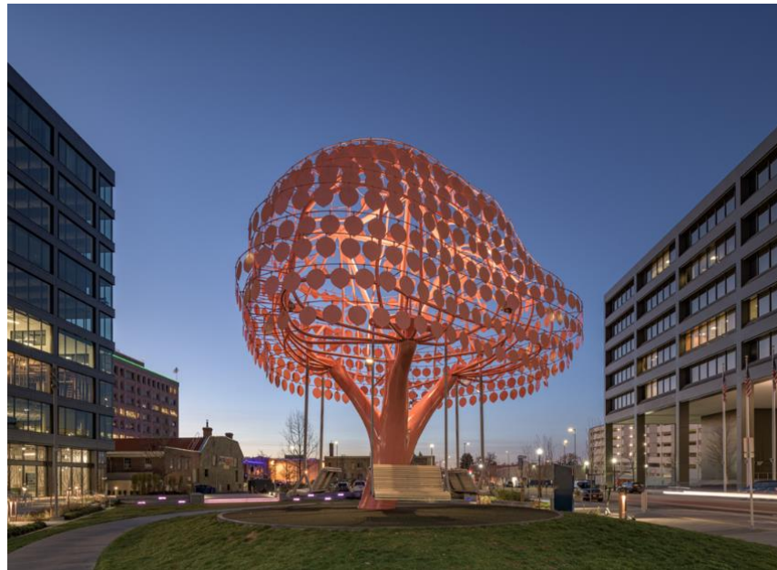
Figure 1 - "Gentle Breeze" by Mathew Mazzotta located in Boise, ID.

Artist Mathew Mazzotta has been selected for the Grand Connection Crossing Artwork Plan. Mazzotta, known for major public art projects across the country (Figure 1), was chosen from a rigorous national call with 20 qualified applicants with both large-scale work experience and public art planning