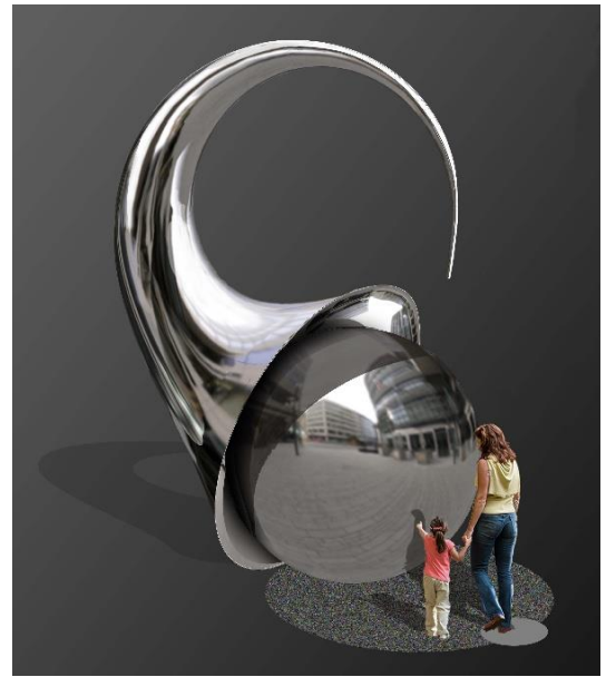
Figure 2 - "Yonder Sky" rendering by Po Shu Wang

Another public artwork specifically created for Bellevue is nearing completion and installation. Po Shu Wang's interactive public artwork, Yonder Sky (Figure 2), will be installed between NE Spring Boulevard and NE 20th Street in the BelRed Arts District. This installation is part of the 130th Avenue NE Streetscape Public Art project and has been in the works since Wang's selection in 2018 for the project. The artwork is both interactive and technical, featuring a "sound bath" where users can trigger a quiet musical collage developed from recordings of musicians. The artist finished fabrication in 2022 and delivered the artwork to Bellevue where it has awaited installation in coordination with the 130th Avenue NE project. Once installed, this work will help welcome guests to the Arts District, serving as a distinctive wayfinding marker, easily visible from the light rail, helping to cement the identity of this creative hub.