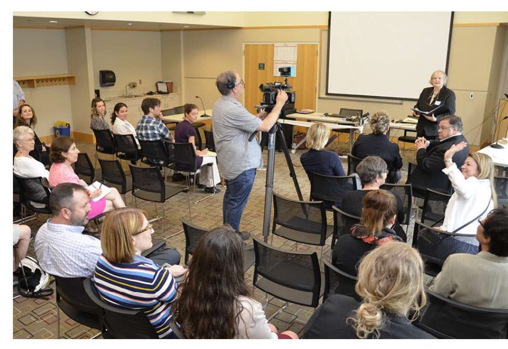
Community Court at Redmond Library