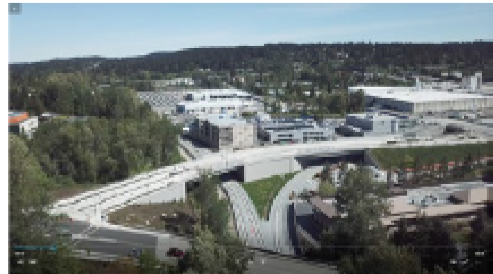
AFTER: Aerial view of NE Spring Blvd Zones 1 and 2 with light rail tracks beneath two new bridges. (2020)