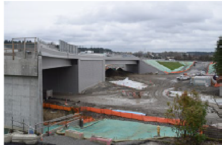
BEFORE: Two bridges on NE Spring Blvd under construction. (2018)