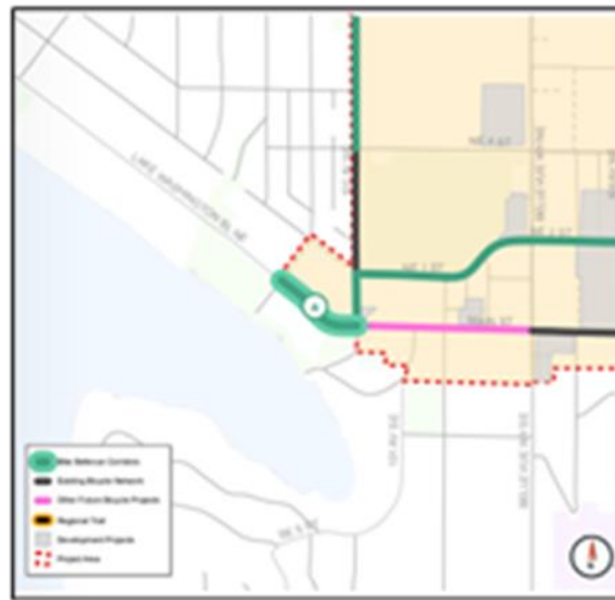
Lake Washington Boulevard