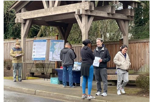
Community members participating in a neighborhood scan in Newport Shores

City staff adapted the neighborhood scan and public space workshop materials to reach community members that typically do not attend or are unable to attend traditional meetings; including youth, older adults, and non-English speakers. Existing engagement activities were adapted to be done in small groups with a community facilitator and allow for participation in different languages.