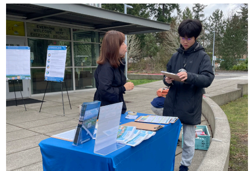
Community member sharing feedback at a public space workshop in Newport