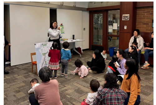
Families participating in a mapping exercise during Newport Library's Chinese story time