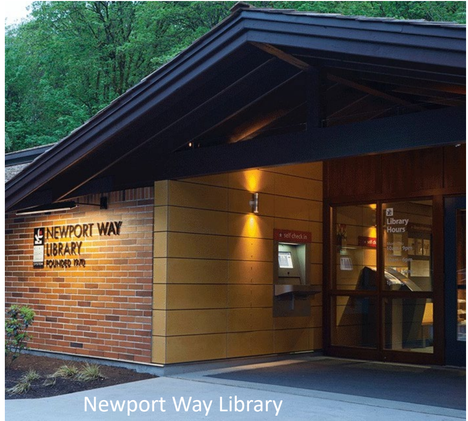
Newport Way Library