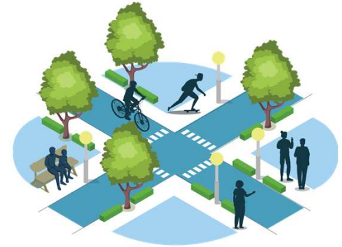
Mobility and Access