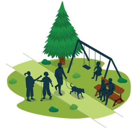
Community Gathering Places