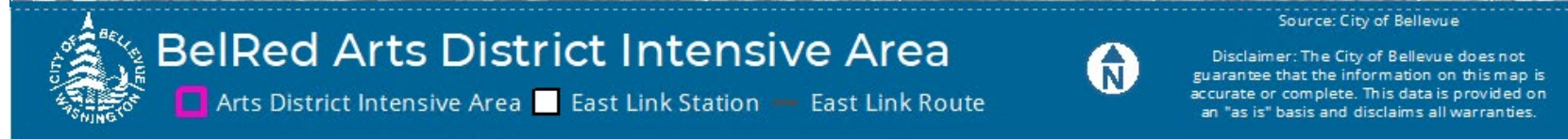
Figure 1. BelRed Arts District Intensive Area.