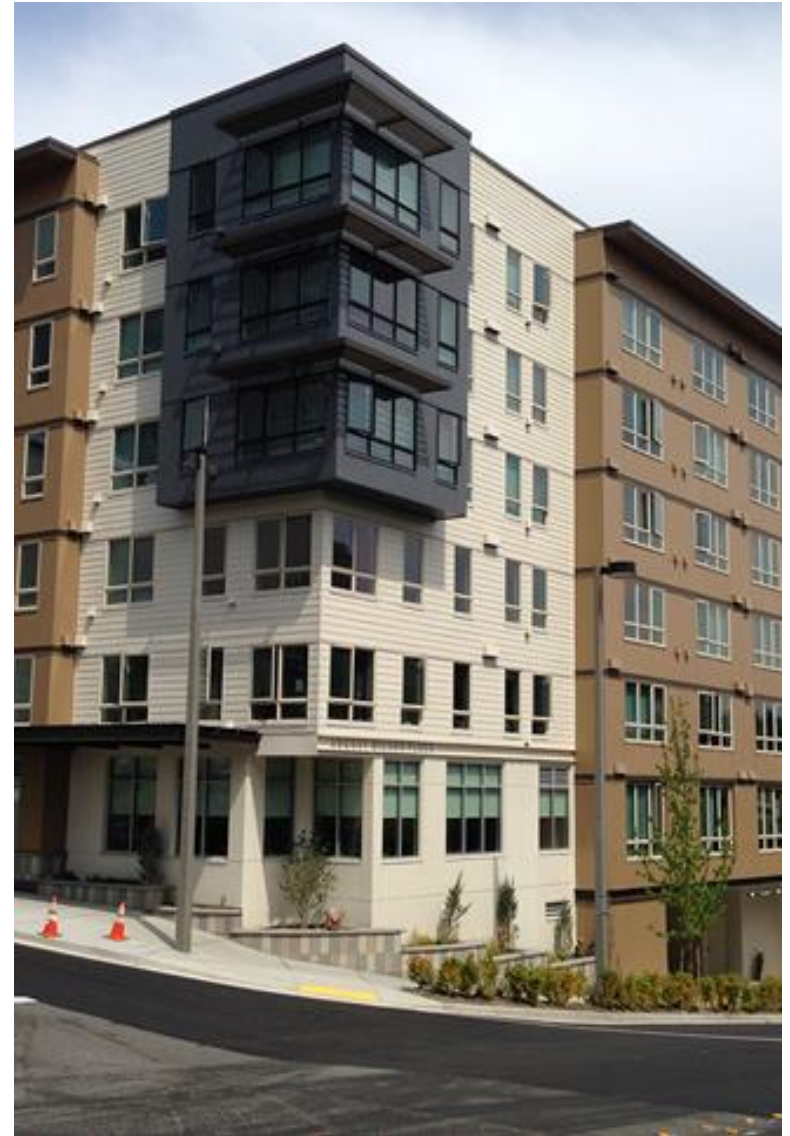
August Wilson Place (LIHI), 57 low-income units