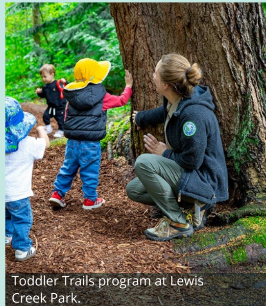
Toddler Trails program at Lewis Creek Park.