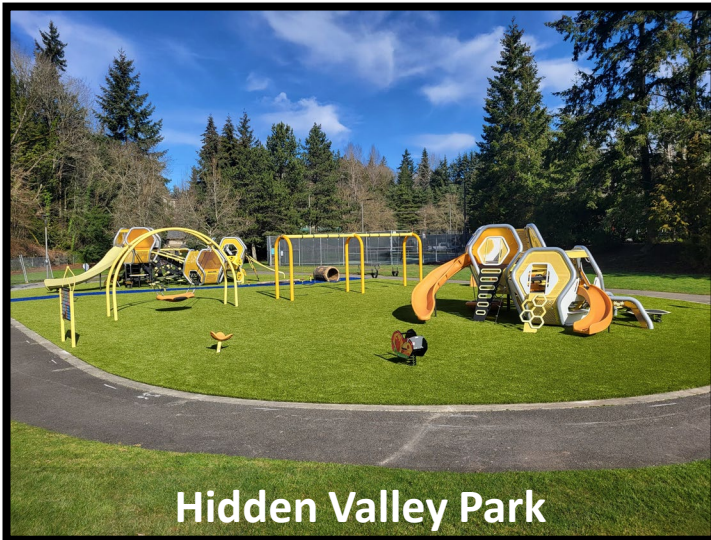
Hidden Valley Park