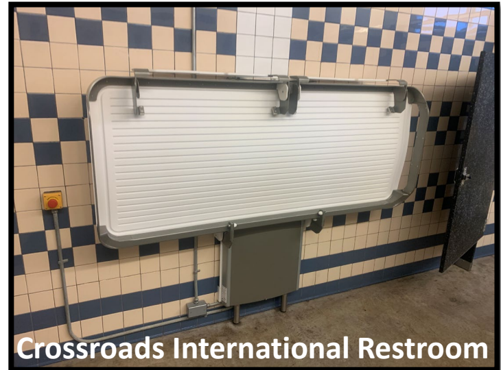
Crossroads International Restroom