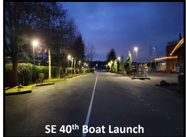
SE 40 th Boat Launch