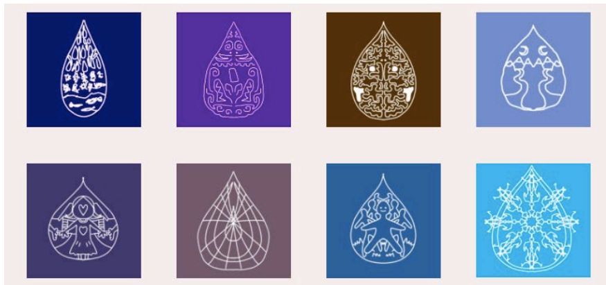
Clockwise from top left: Rain Village community art project; American Asian Performing Arts Theatre's Ode to Spring variety show; Barvinok Virtual Fundraiser Concert