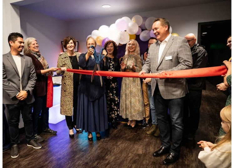
Image 3: Ribbon cutting with Mayor Robinson, Councilmember Nieuwenhuis, and King County Councilmember Balducci.

Phase two: Purchase and installation of a ceiling grid system for lights, theatre lights, projector, AC system, and insulation of the back wall. New LED lights (par, spot, and Fresnel) will be permanently secured to the grid and last over ten years.