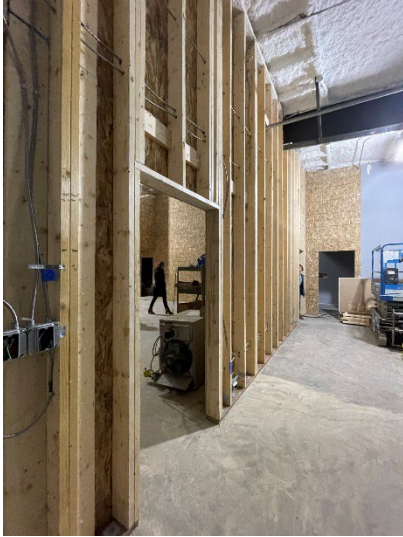
Image 2: Construction of new theatre space in BelRed; photo taken in Nov '22.