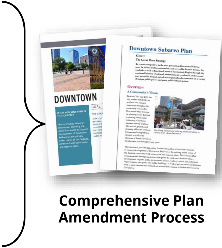
Comprehensive Plan Amendment Process