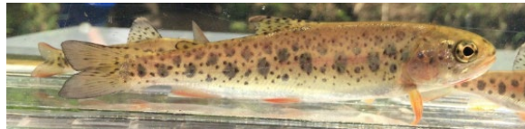
Environmental Svcs Commission