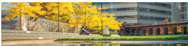
Parks & Community Services