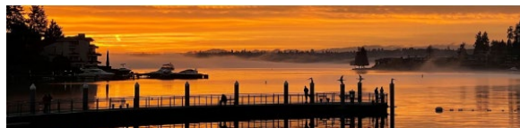
Human Services Commission