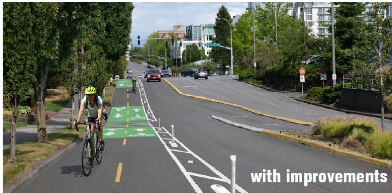
NE 12th Street west of Bellevue Way