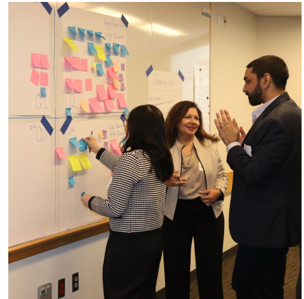
Subteams working onsite at the 3 rd Innovation Forum meeting.