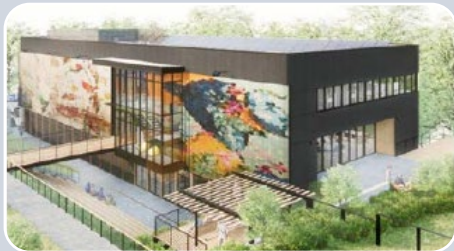
Eastside Men's Shelter