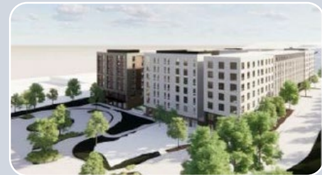
Polaris at Eastgate Workforce Housing