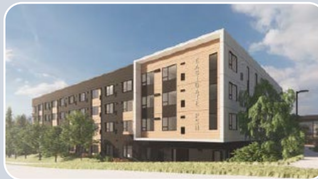
Eastgate Supportive Housing