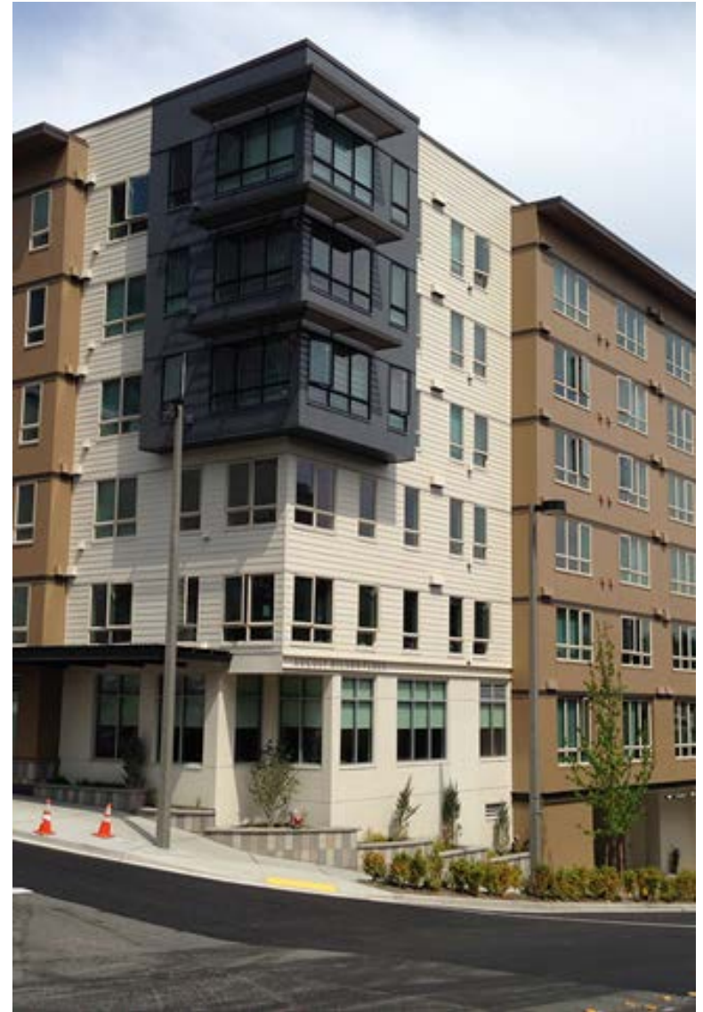
August Wilson Place (LIHI), 57 low-income units