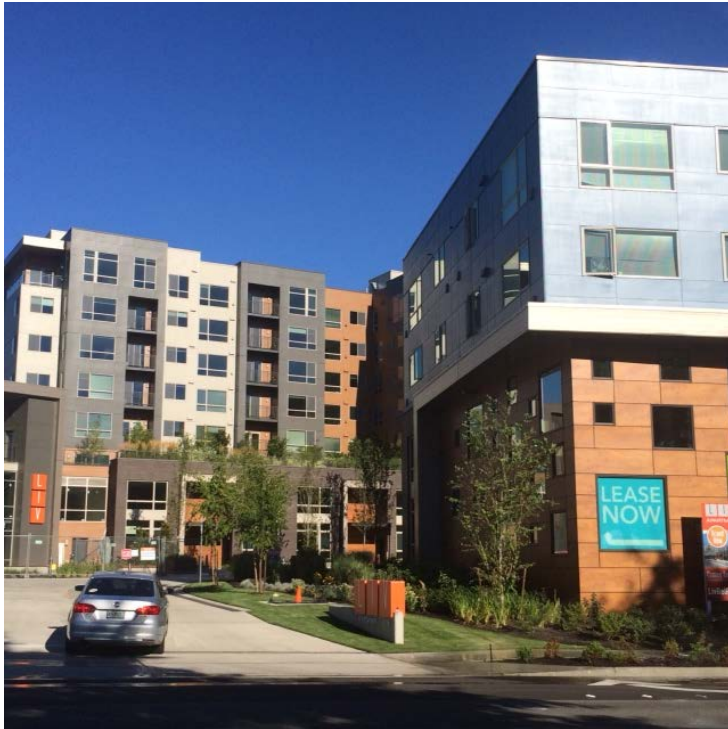
LIV Bellevue, BelRed FAR, 54 affordable units