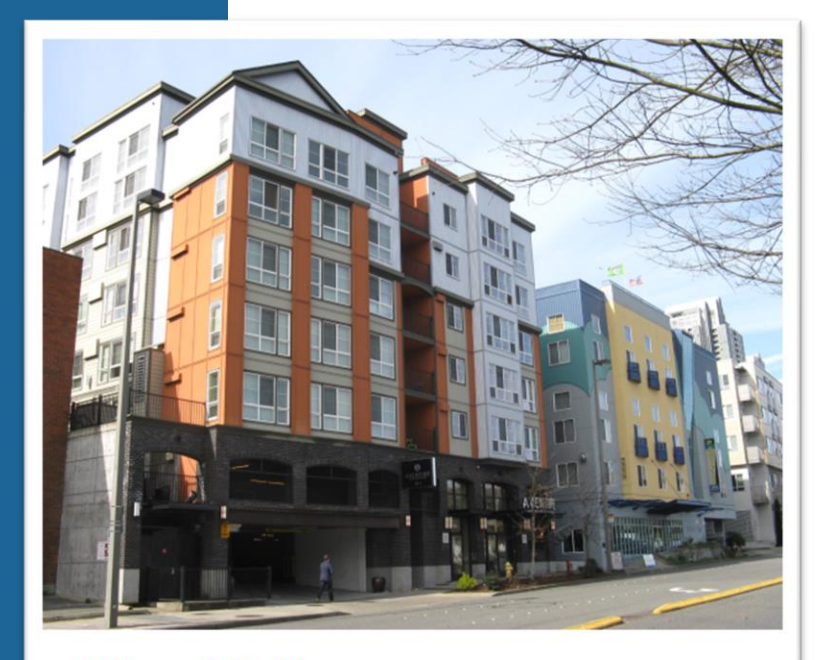
City of Bellevue Affordable Housing Strategy