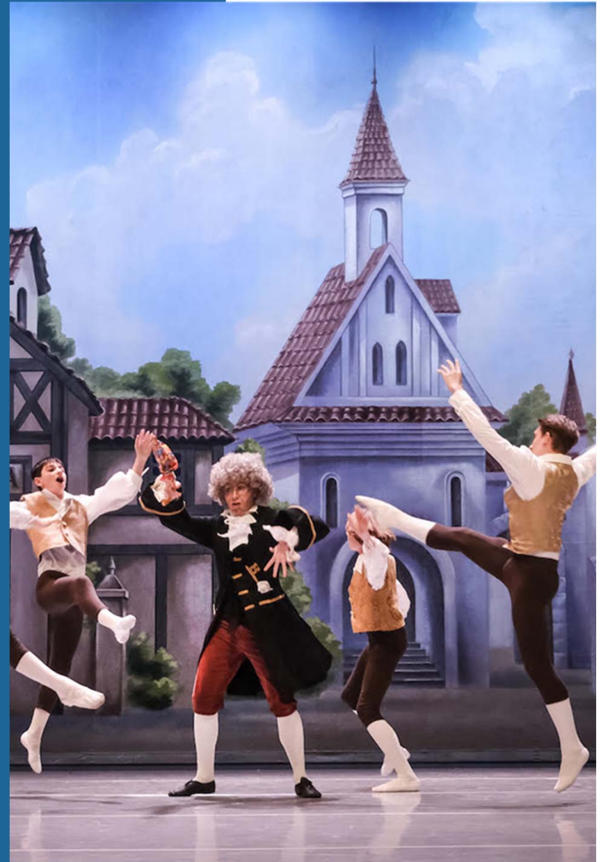
Emerald Ballet Theatre Coppelias Ballet