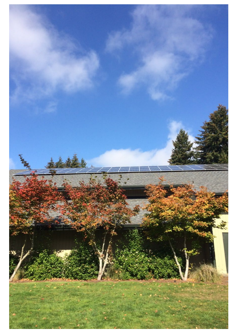
Solar array on Crossroads Community Center.