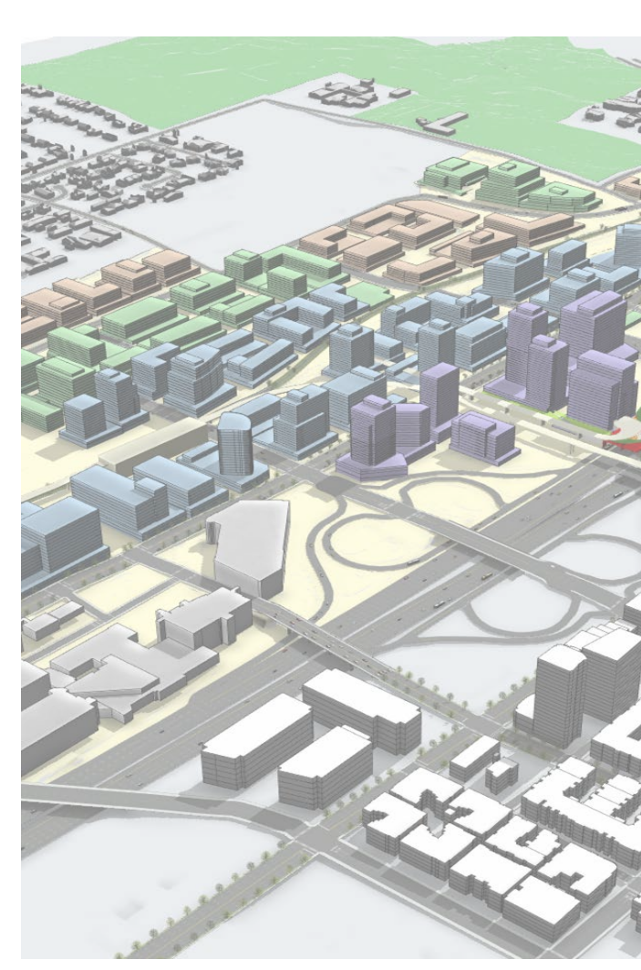
Wilburton CAC Vision 2018