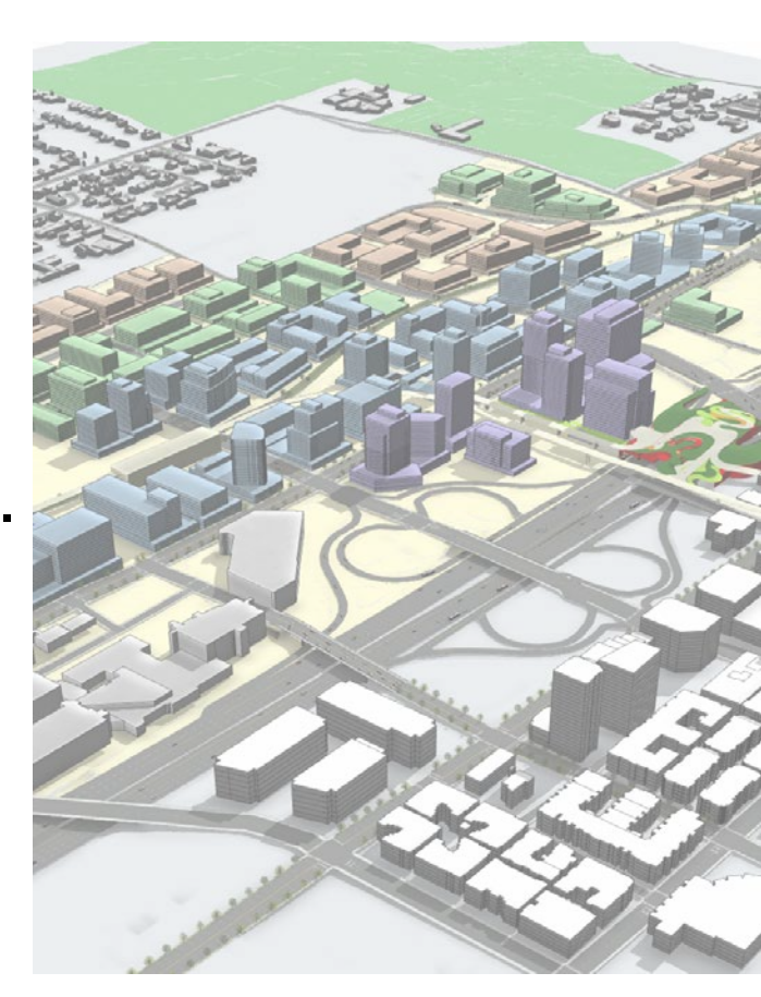
Wilburton CAC Vision 2018