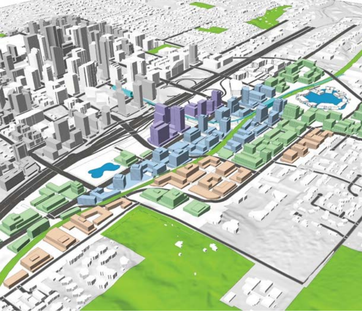
Wilburton Study Area