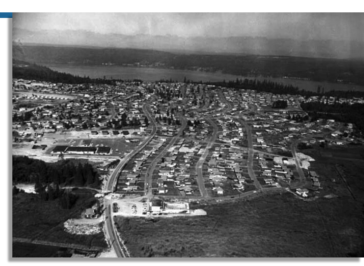
Lake Hills development, late 1950s