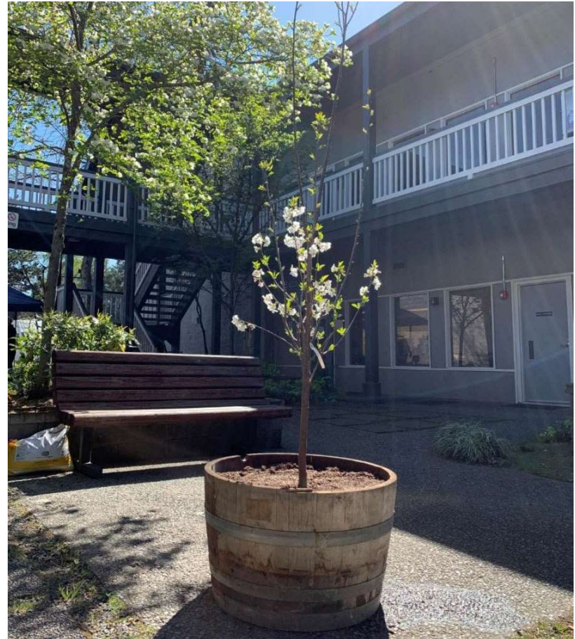
TPSF Example: Lincoln Center temporary shelter operated by CFH