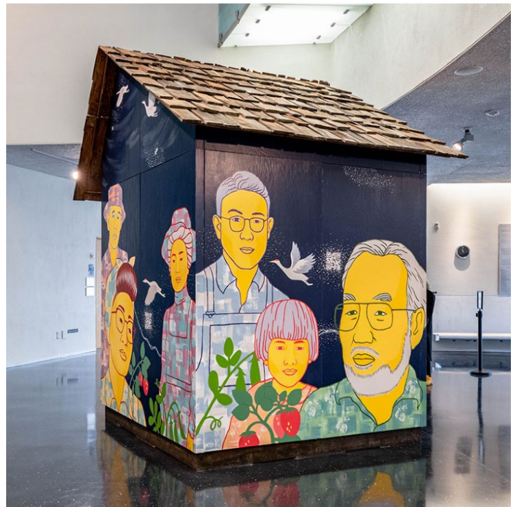
Emerging Radiance on display at the Bellevue Arts Museum