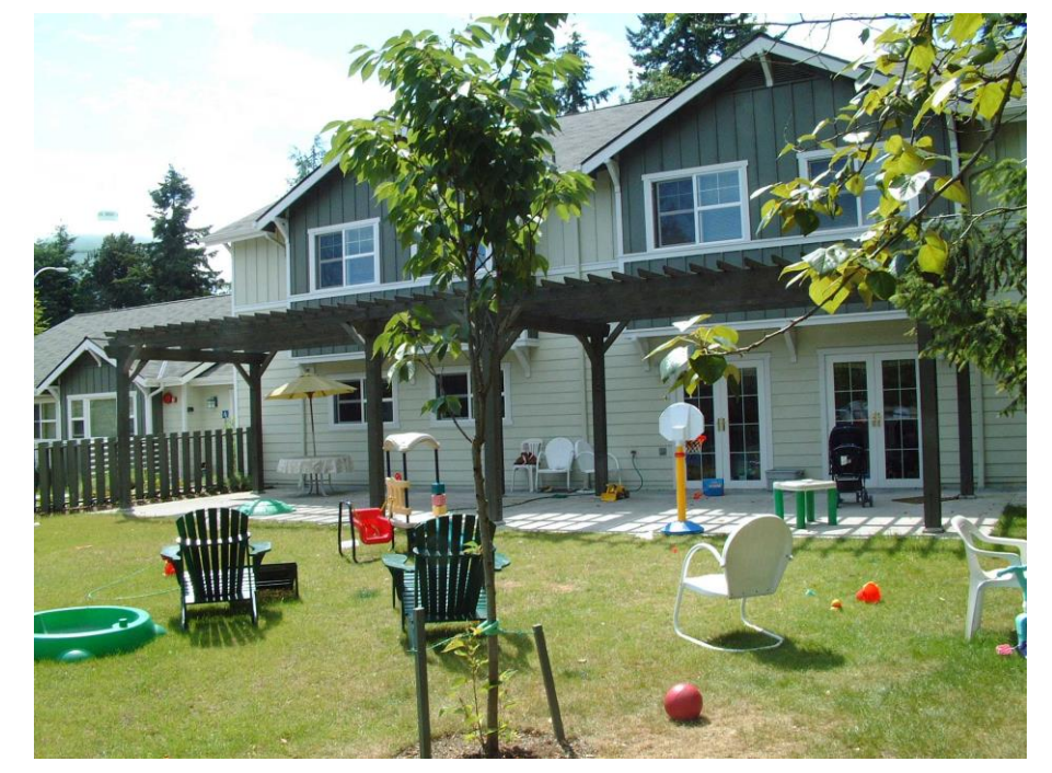
Harrington House – Family rentals – Crossroads 8 affordable units.