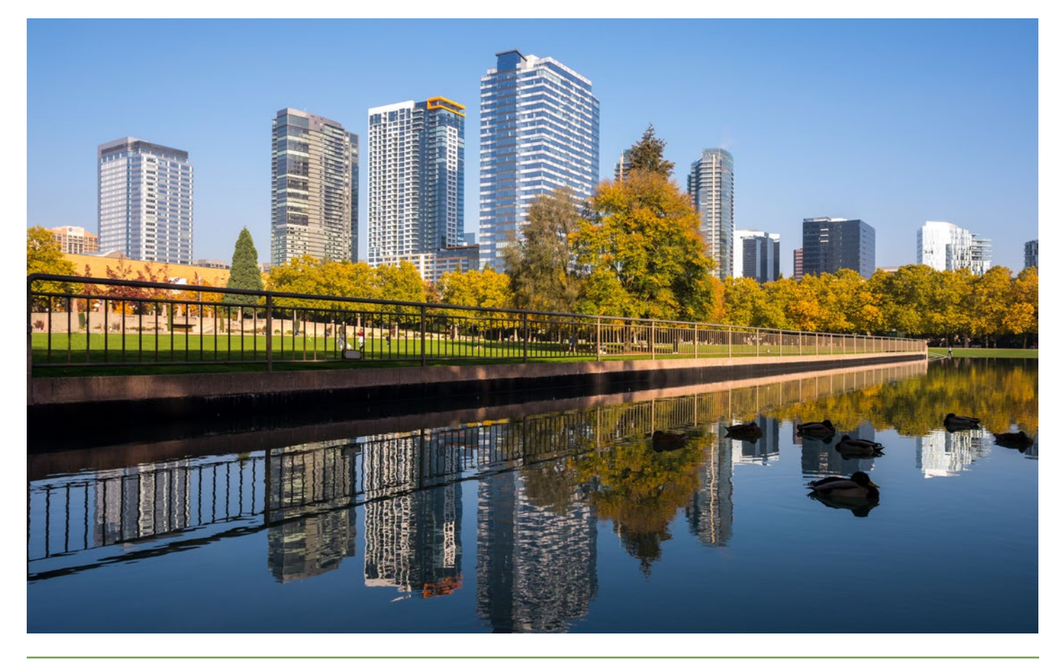
City of Bellevue Comprehensive Plan 2044 Introduction & Vision Page IV 2

The vision is based on the City Council Vision.