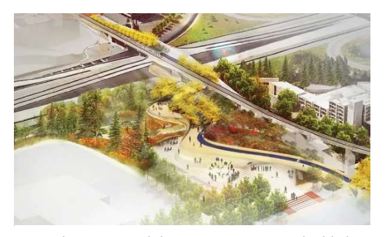
Example image used during engagement to highlight policy moves around implementation of future investments, including the Grand Connection across I-405.

• Desire for greater transparency in the implementation process (in terms of financial strategies, timing, etc.)