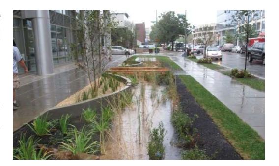
Example image used during engagement to highlight policy moves around green stormwater infrastructure and vegetation in the TOD area.