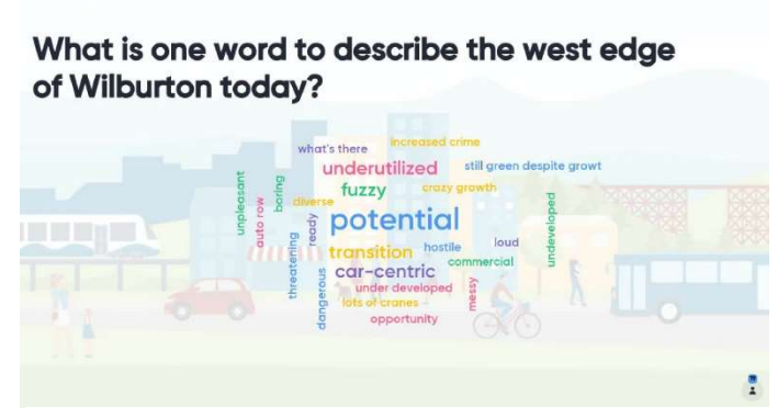
Example of Mentimeter prompts that allowed attendees to submit and read other attendees' responses in real time.