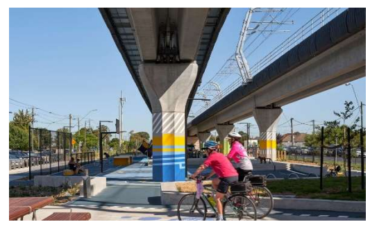
Example image used during engagement to highlight policy moves around art opportunities integrated into infrastructure.