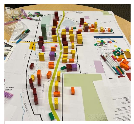
Youth used different colored lego pieces, markers, stickers, and construction paper to represent different land use and placemaking ideas.

Throughout the spring, the planning team presented to different boards and asked for input on how to best engage different communities around the development of policies for the Wilburton TOD, and on key policy considerations.