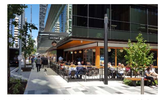
policy moves around supporting development standards that provide for more pedestrian-friendly activity.