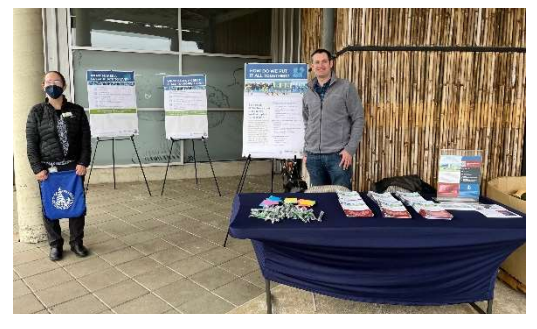
The planning team tabled at locations within the community, such as Uwajimaya grocery store.