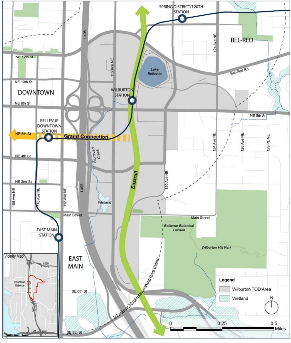
Map of the Wilburton TOD area

The Wilburton TOD area is located east of I-405 across from Downtown Bellevue. It is part of the larger Wilburton Neighborhood Area. Specifically, it is the 300-acre area bounded by NE 12<sup>th</sup> Street to the north, the Lake Hills Connector to the south, I-405 to the west, and 124<sup>th</sup> Avenue NE / 118<sup>th</sup> Avenue SE to the east. The TOD area is next to some of largest and most popular parks in the city, including the Bellevue Botanical Garden and Wilburton Hill Park. Very little housing exists in the Wilburton TOD area today, while there is a wide range of commercial uses, including hotels, auto dealerships, medical facilities, grocery stores, restaurants, and professional offices. The Wilburton light rail station, Eastrail multi-use corridor, and Grand Connection will attract and support new housing (including affordable housing), economic development, multimodal transportation projects, cultural amenities, and sustainability opportunities. Updates to existing policies and codes will help facilitate redevelopment in the Wilburton TOD area and meet these emerging needs.