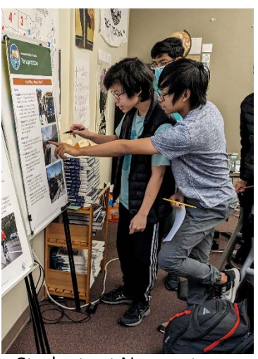
Students at Newport High review policy moves

Youth were able to view information boards on proposed policy moves, provide feedback and ask questions. Follow up activities included a field trip to City Hall for students from Big Picture School to practice giving testimony and attendance at future Planning Commission meetings for Bellevue High School students.