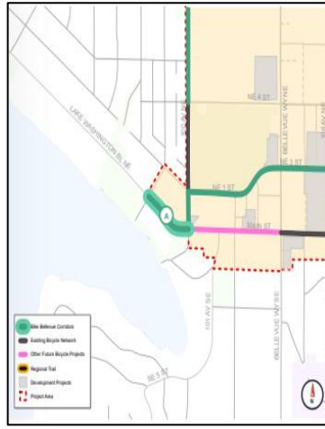
Lake Washington Boulevard