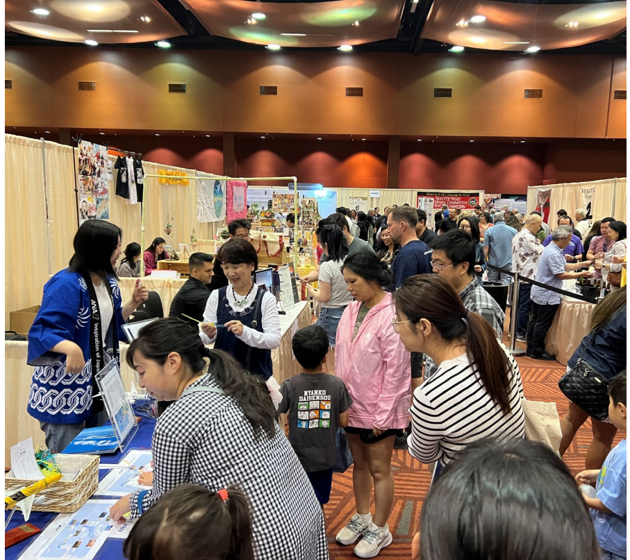
Image: Japan Fair at Meydenbauer