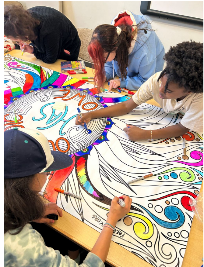
Image: Free2Luv's mental health art workshops with Bellevue School District students